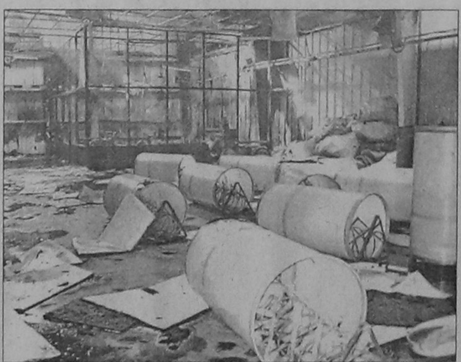
Inside view of Sonargaon Textile Mills in Barisal, gutted yesterday.

Later police recovered a shutter gun and four bullets from the spot.