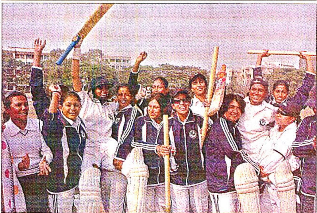
Triumphant Dhaka players are in party mood after they won the Meril first-ever Women's Divisional Cricket Tournament beating Chittagong in the final at the Dhanmondi Cricket Stadium yesterday.