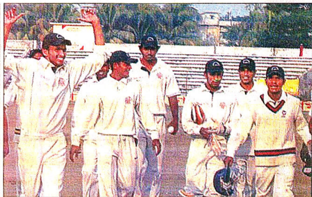
Rajshahi players come off the field after defeating Khulna on the fourth and final day of their National Cricket League match at the Rajshahi Divisional Stadium yesterday.

NEW ZEALAND (FROM): Daniel Vettori (captain), Brendon McCullum (Wicketkeeper), Jamie How, Peter Fulton, Scott Styris, Ross Taylor, Mathew Sinclair, Jacob Oram, Kyle Mills, Mark Gillespie, Chris Martin, Jeetan Patel