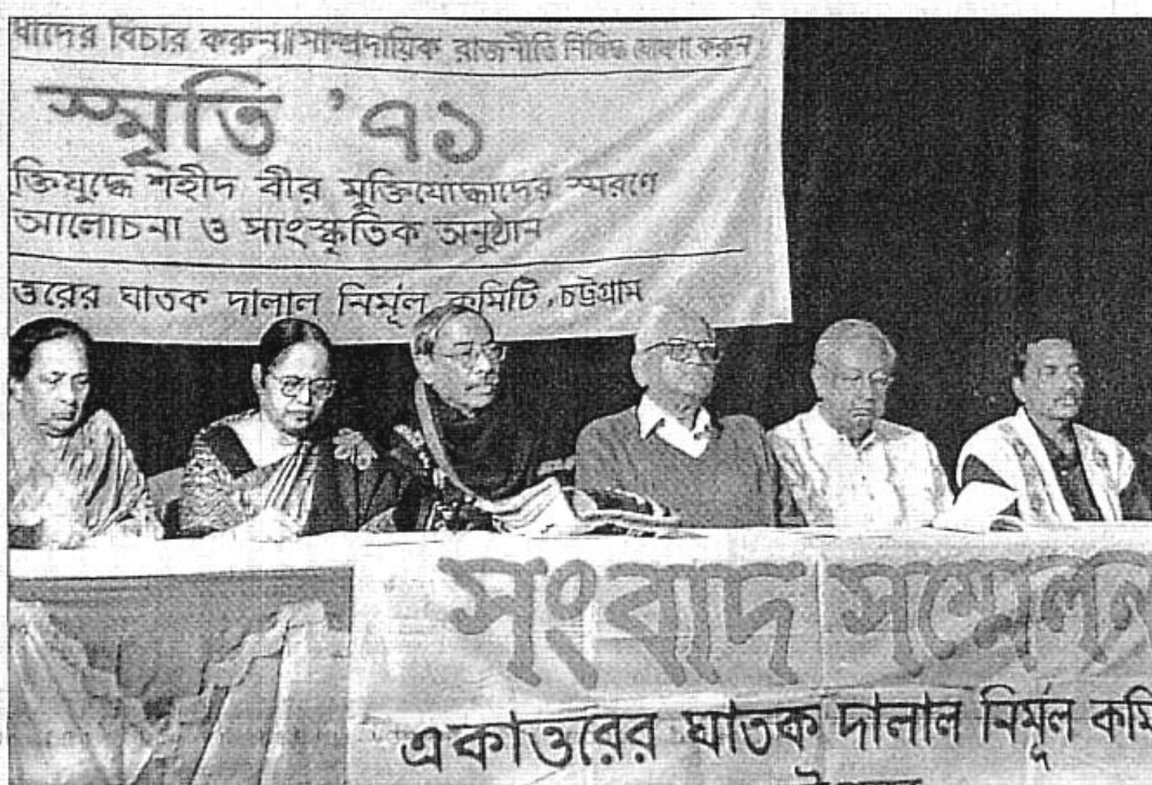
Participants at a discussion demanding trial of the war criminals at the Shilpakala Academy in Chittagong yesterday.