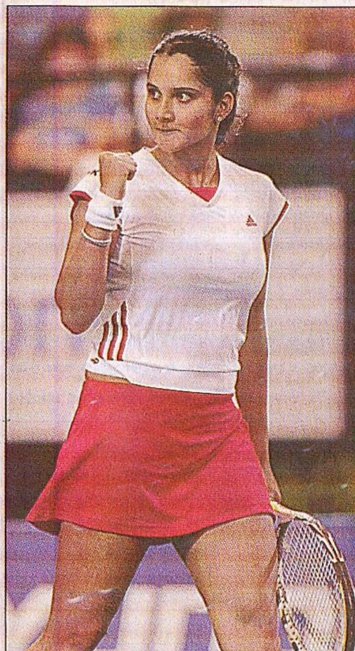
Sania Mirza of India celebrates after winning a point against Meghann Shaughnessy of the US during their Hopman Cup match in Perth on Saturday.