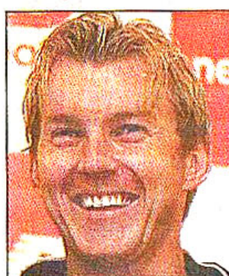
Brett Lee (Australia fast bowler)

"It feels fantastic... when you're nine years of age, you think about playing one Test match or even taking one Test wicket. But to think that you're in the 250 club, it's a pretty special moment. I'm a very proud man."