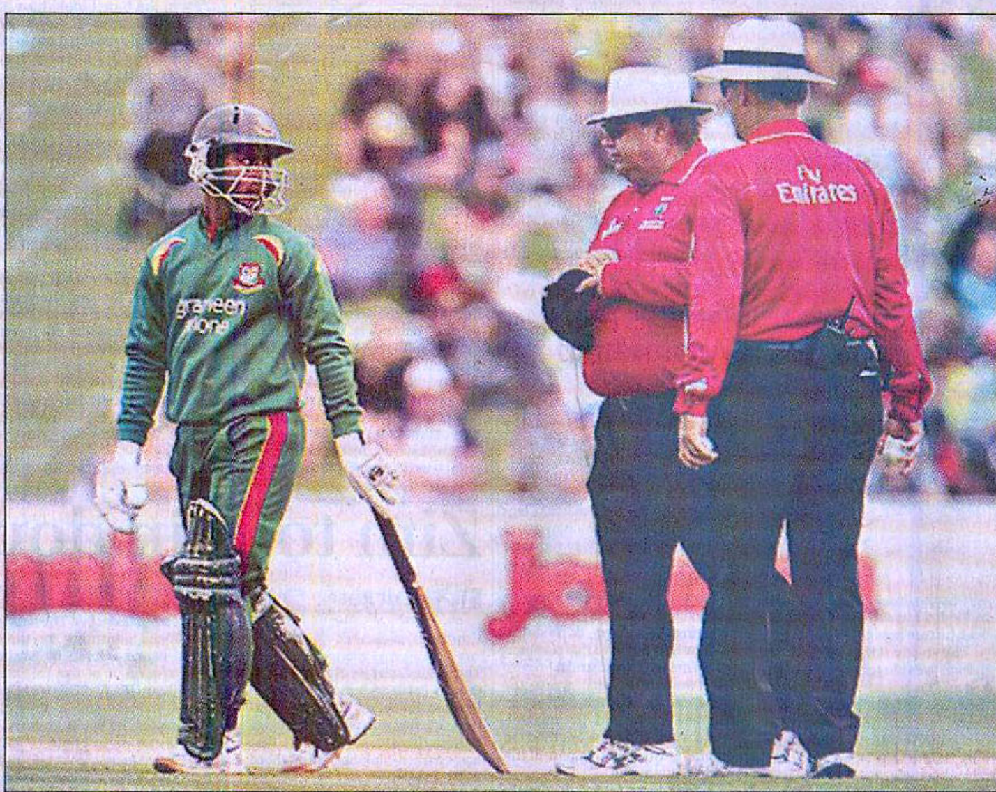
WAS IT A CATCH REALLY? Bangladesh captain Mohammad Ashraful looks at the umpires with a big question mark on his face as he trudges back to the dressing room after he had been given out caught by Ross Taylor off the bowling of Kyle Mills during the second one-day international against New Zealand at the McLean Park in Napier yesterday.

National Cricket League (Round Nine, Day Three) Chittagong v Dhaka Venue: Chittagong Divisional Stadium Rajshahi v Khulna Venue: Rajshahi Divisional Stadium Sylhet v Barisal Venue: Shaheed Chandra Stadium, Bogra