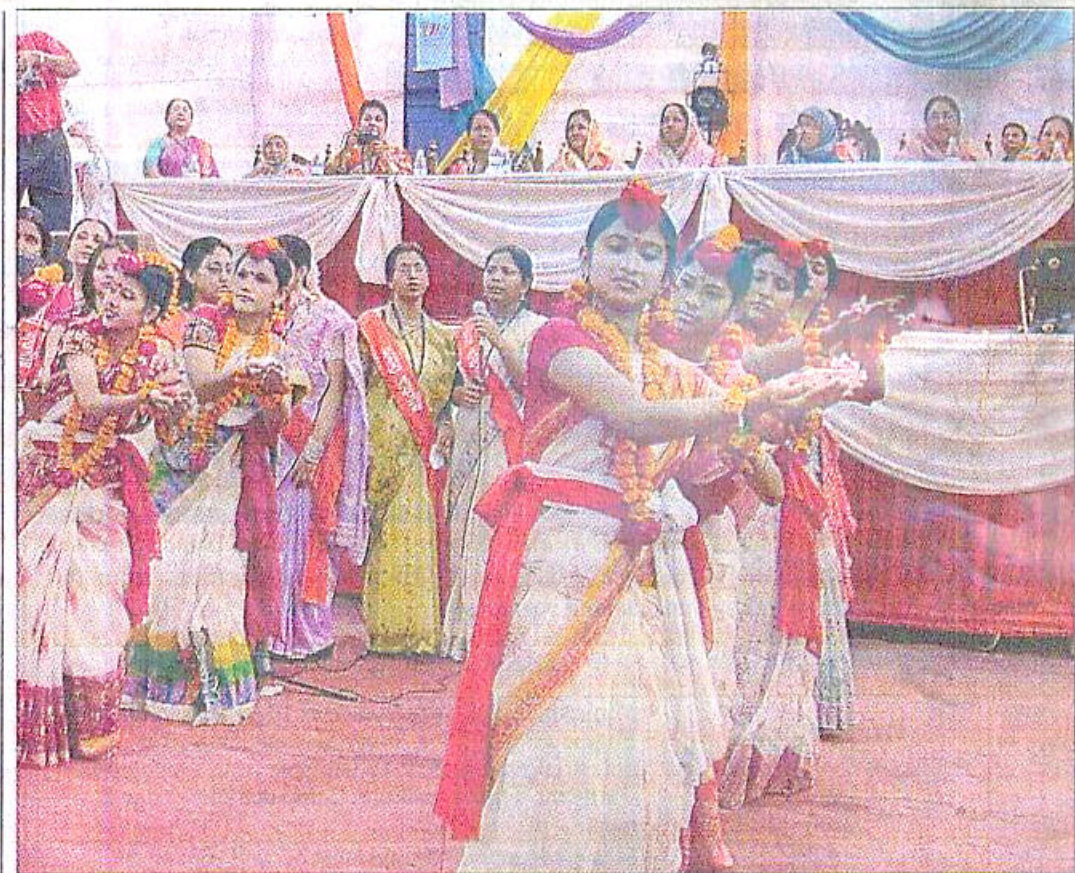
Students of Dr Khastagir Government Girls' School perform a dance number at the inaugural ceremony of a celebration marking the 100th anniversary of the school in Chittagong yesterday.

Copies of the statements made by 15 US senators and 61 Canadian parliament members were also attached with the memorandum.