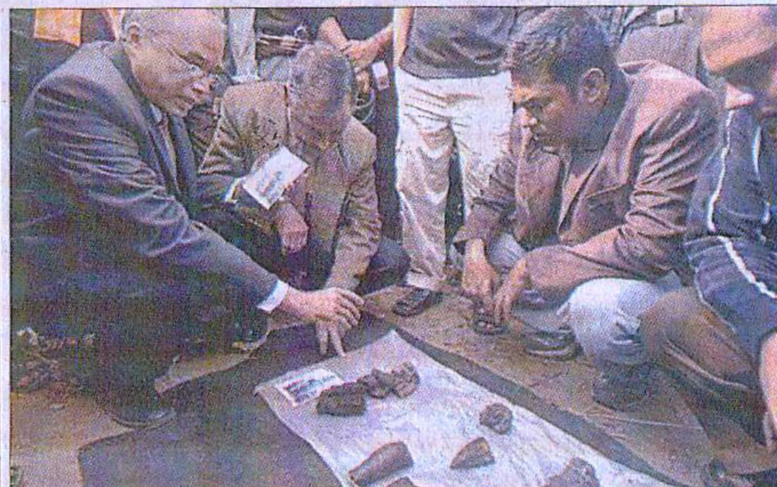
Officials of the National Museum look at the recovered pieces of broken Vishnu statues at Amin Bazar on the outskirts of the capital yesterday. Two Vishnu statues were stolen from the Zia International Airport on December 22. The officials, right, put broken pieces together in a bid to reassemble them.