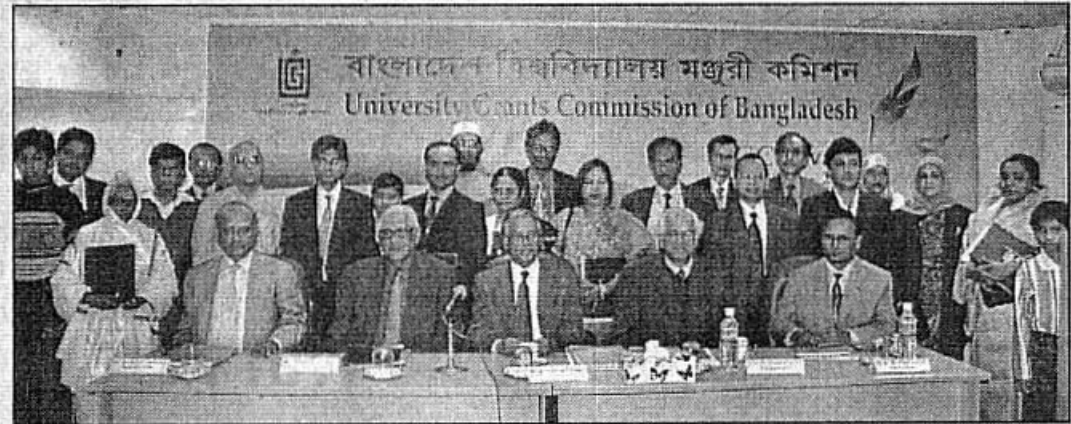
Scholars who were honoured with 'University Grants Commission (UGC) Award 2002-2005' for their outstanding research works pose for photograph with the guests at the award giving ceremony at the UGC auditorium in the city yesterday.

On the occasion, milad mahfil and special prayers will be held after Asr prayers and a daylong Quran Khwani at her South Manikpur residence.