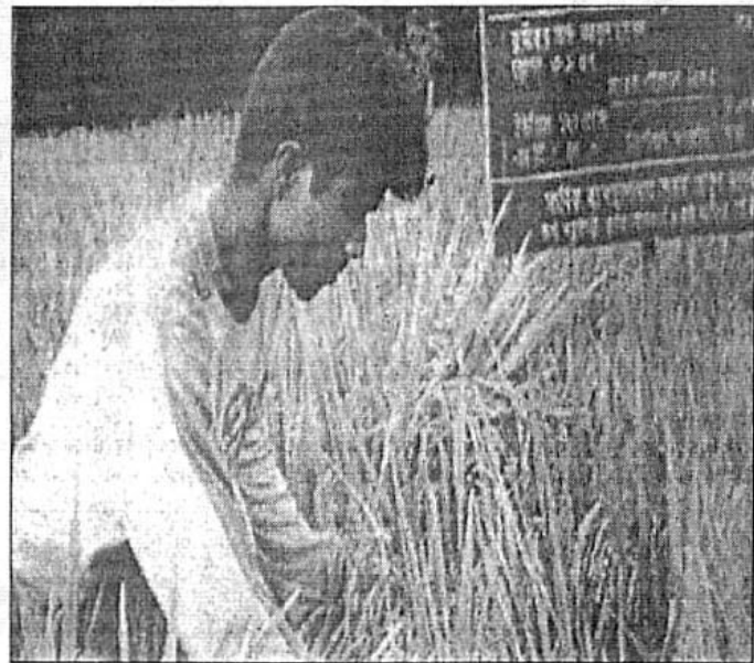
A farmer in Satuti village in Gouripur upazila harvesting the Indonesian variety of aromatic rice.

ies of aromatic rice give any yield of 25-30 maunds per acre.