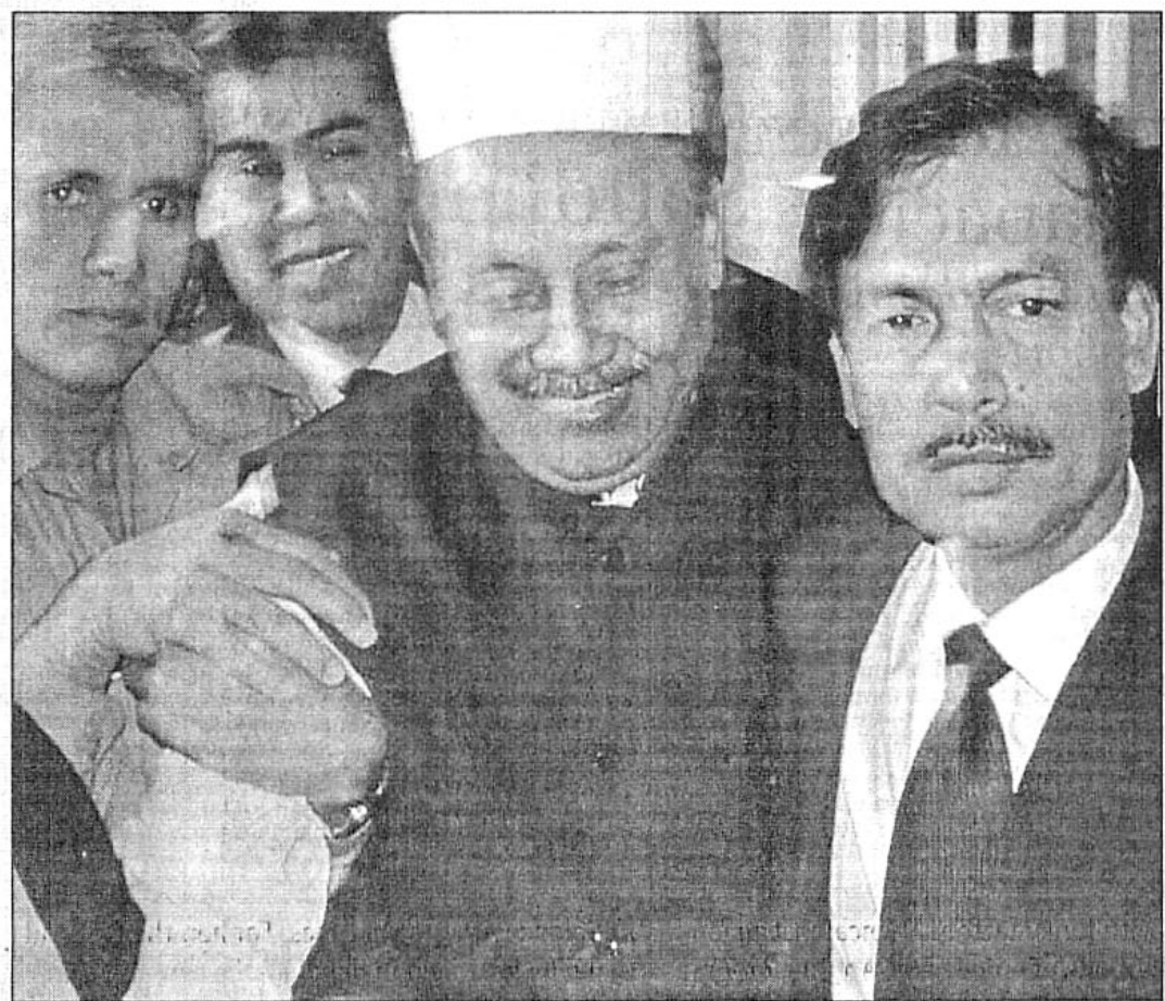
Mayor Mohiuddin Chowdhury was produced before a court in Chittagong yesterday in Bijoy TV scam case.

Underground communist groups who are thriving on extortion and toll in the name of class struggle infest Jhenidah and adjoining districts.