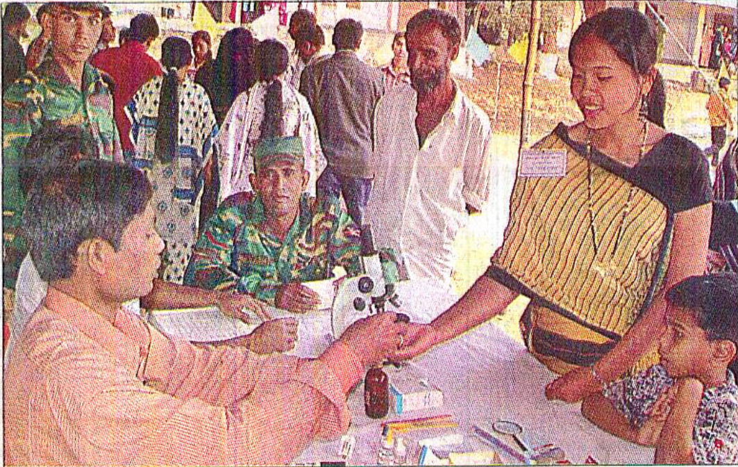
Army organises a mobile blood bank at Matiranga Degree College recently.

ABDULLAH AL MAHMUD The army organised a programme titled "Mobile blood bank programme" at Matiranga Degree College to fight anaemia and malaria that frequently take lives at Matiranga upazila in Chittagong Hill Tracts. Over 14,000 people were reportedly attacked with malaria and 2002 with anaemia in the last 10 months since January in the upazila having a population of 1,34,000, sources said. Of them, 576 were attacked with cerebral malaria that killed eight people in three months until October while two died due to anaemia. Attack and death of many due to malaria and anaemia in remote areas of Matiranga, the most populated upazila, remain unreported or uncounted for, they said. The people, including tribal and non-tribal, are getting their names registered in eight groups