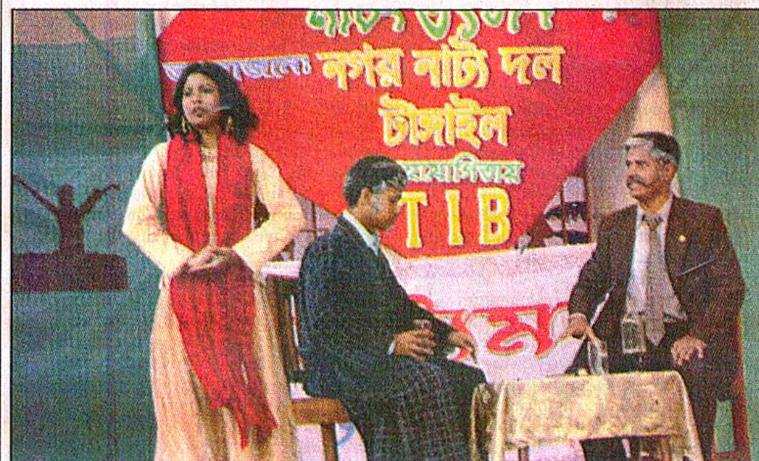
A scene from the play Butterfly