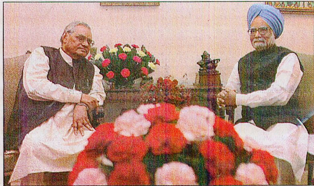
Former Indian prime minister Atal Bihari Vajpayee (L) talks with Indian Prime Minister Manmohan Singh (R) at his residence in New Delhi yesterday on the occasion of his 83rd birthday celebration.

Tens of thousands of people have died on both sides since the LTTE launched its armed struggle for a Tamil homeland in the majority Sinhalese nation in 1972. A Norwegian-brokered 2002 truce began to unravel in December 2005.