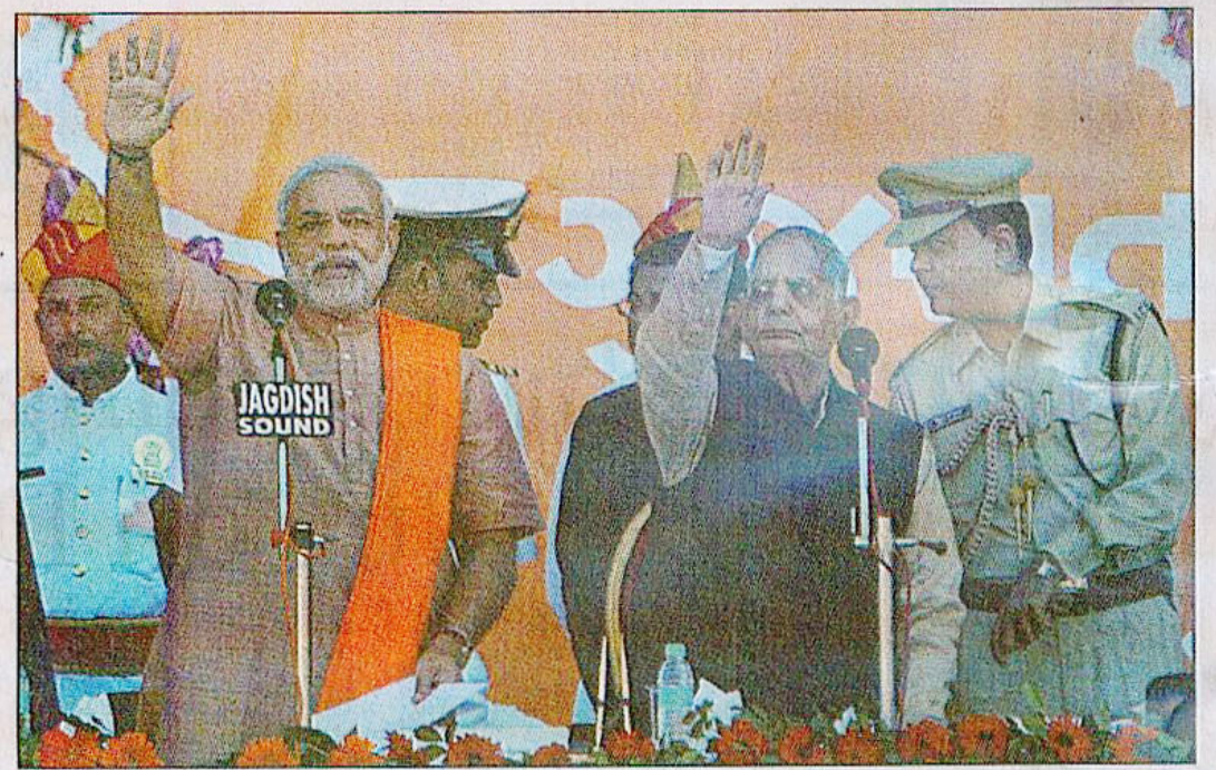
Chief Minister of western India's Gujarat state, Narendra Modi, (L) and Governor of Gujarat, Naval Kishore Sharma wave before the swearing-in ceremony of Modi as Chief Minister for the third time at Sardar Patel stadium in Ahmedabad yesterday.

Earlier a triumphant Narendra Modi on Monday sought to quash talk of him overshadowing his party, saying that he was not "bigger" than the BJP, which was his "mother". Modi was speaking to the newly-elected party MLAs who unanimously elected him as their leader for the next five years.