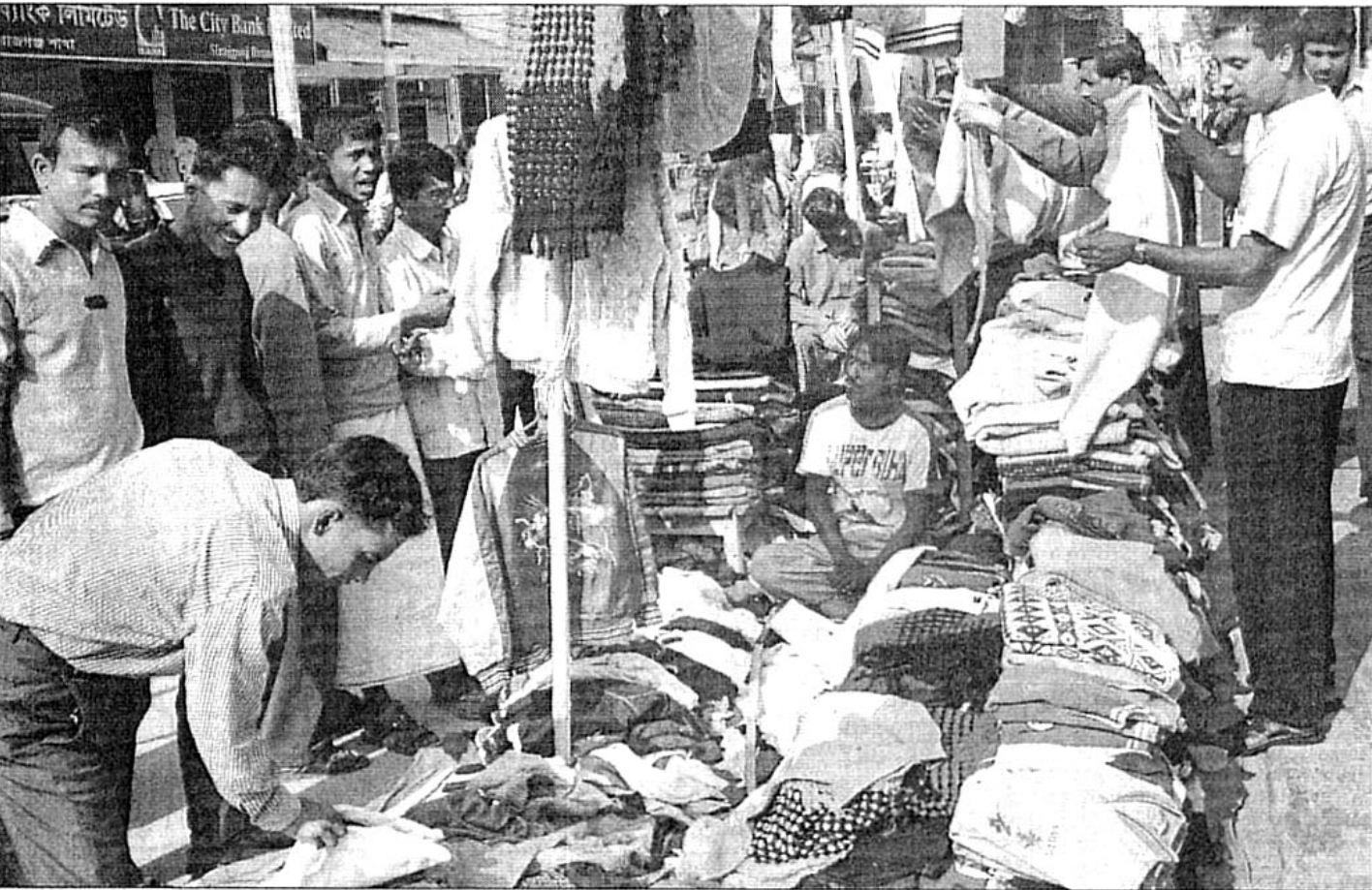
As mercury falls low-income people throng roadside shops and markets in urban rural areas. The photo was taken from Baro Bazaar Zame Mosque area in Sirajganj town yesterday.

He said the situation has improved after proclamation of emergency and customs duty and VAT are collected now.