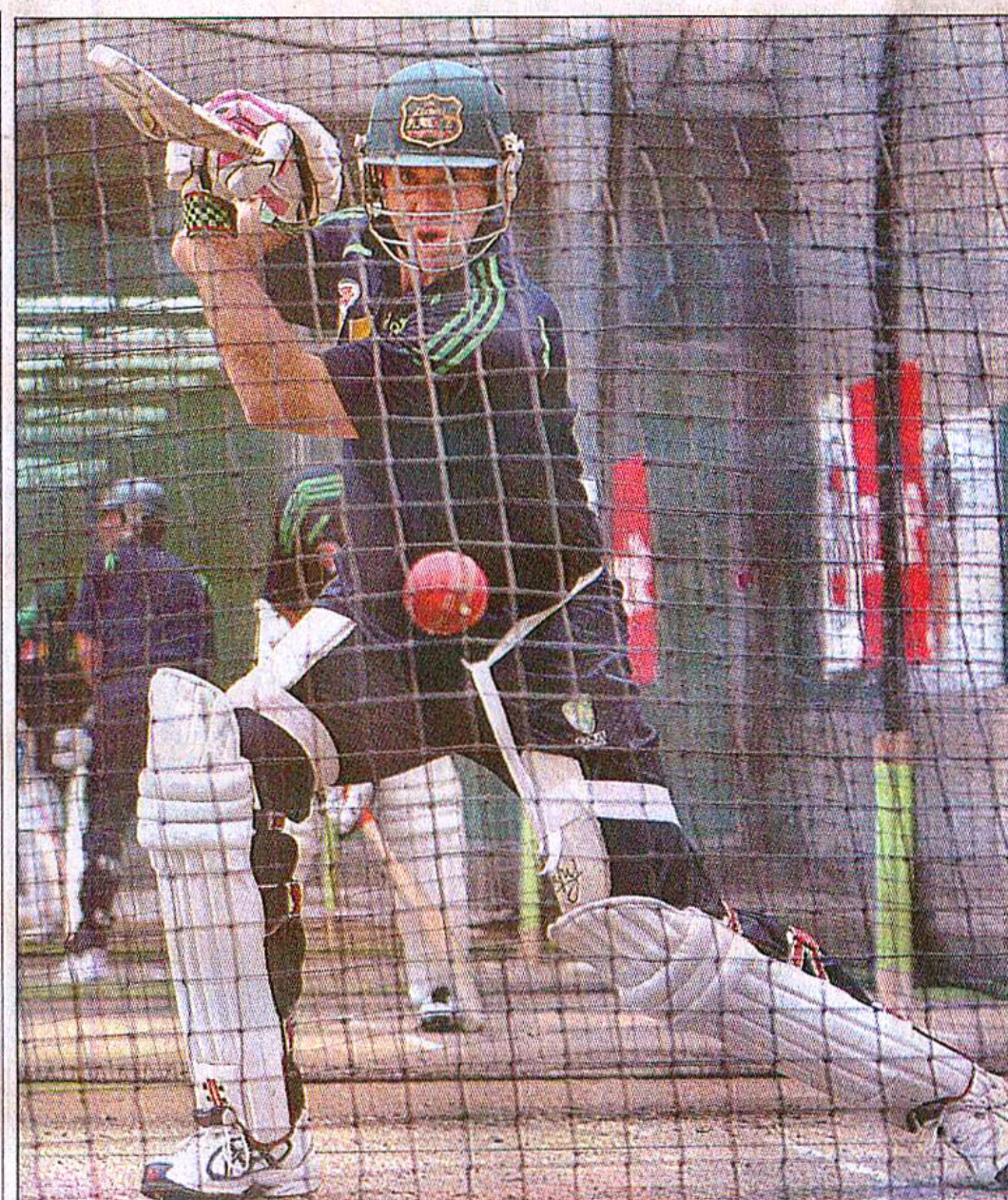
Australian star batsman Matthew Hayden drives a ball during a practice session at the MCG in Melbourne yesterday.