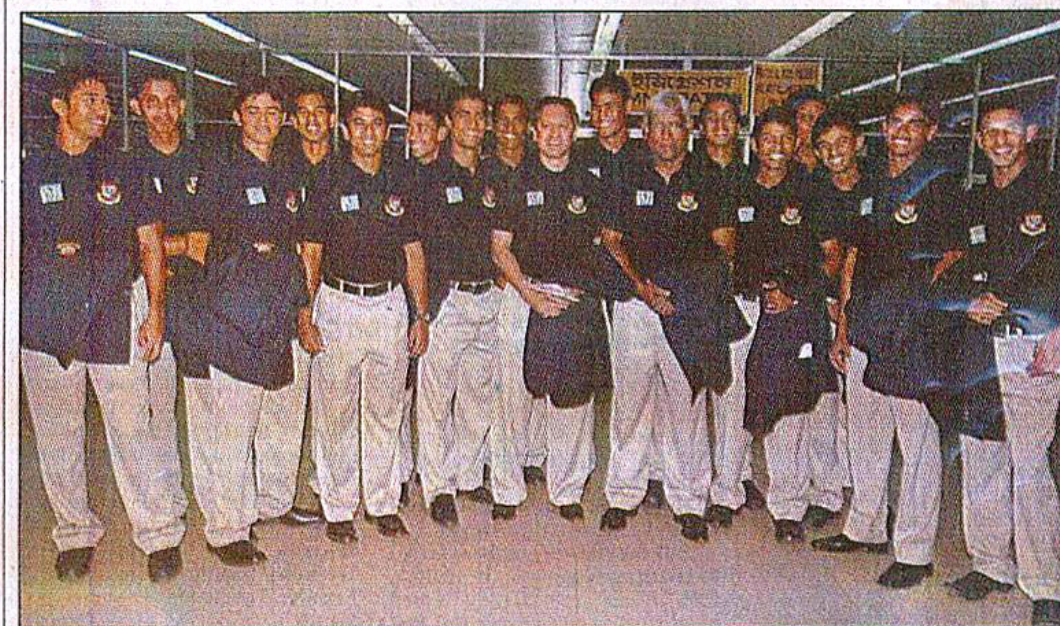
Bangladesh Under-19 cricket team members pose for photograph at the Zia International Airport yesterday before their departure for South Africa to play a three-day match and a triangular limited-overs series involving the hosts and India.