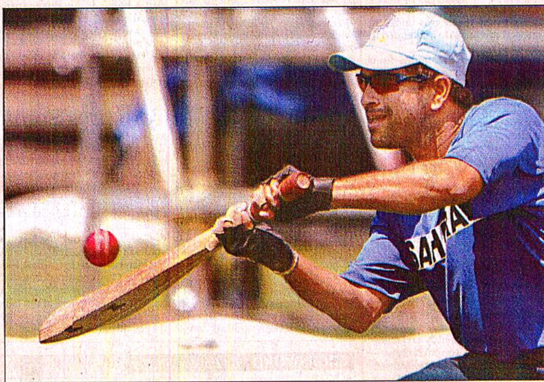
Master Indian batsman Sachin Tendulkar gives slip catches after his side's tour match against Victoria fell through due to rain in Melbourne on Friday.