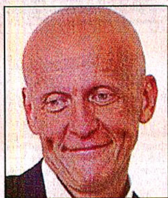
Pierluigi Collina (Former FIFA referee)

"Football needs respect from every angle. We can speak about different situations where respect is needed and certainly this is one. We need respect between players and referees on the field, and between managers and players as well."