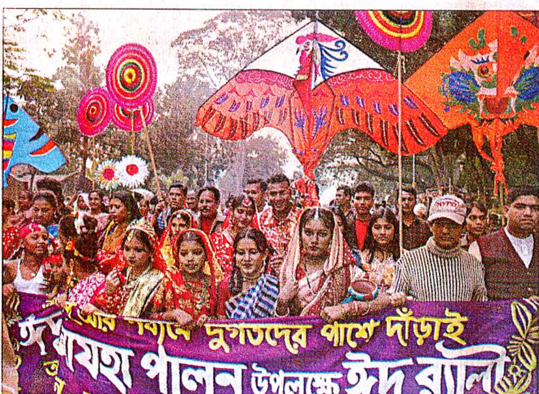
Social organisation Dhakabashi brings out a colourful procession from Shishu Academy in the capital, a day after Eid-ul-Azha, to celebrate the religious festival.