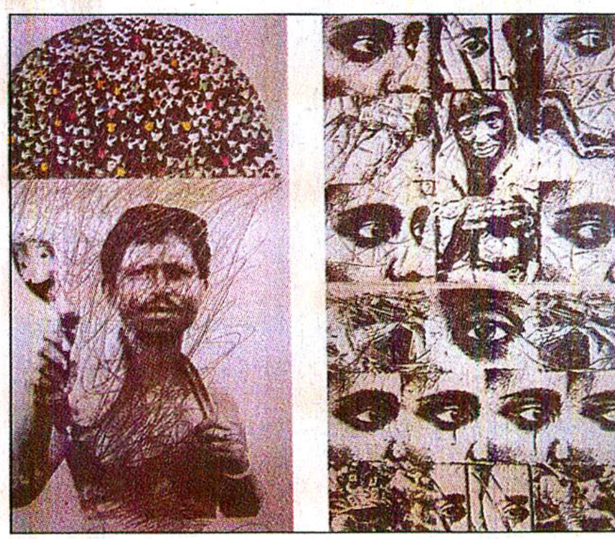
Artworks on display