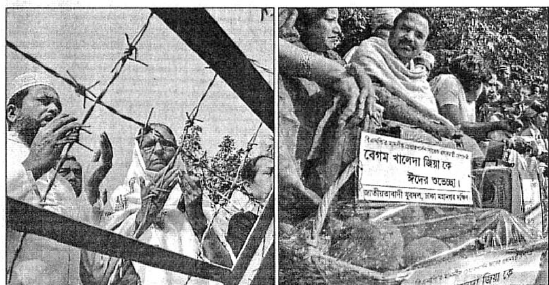
(Left) Awami League leaders and workers pray for detained party President Sheikh Hasina near the sub-jail in Sangsad Bhaban area on Eid day. (Right) BNP leaders and workers wait near the sub-jail in Sangsad Bhaban area as they brought various foods for detained party Chairperson Khaleda Zia on Eid day.

The voter-listing task of DCC would resume on December 26 since the seasonal holidays for the officials involved in the task have been extended till December 25, he said, and expected the voter listing task to be completed by January 31 in Dhaka as announced earlier.