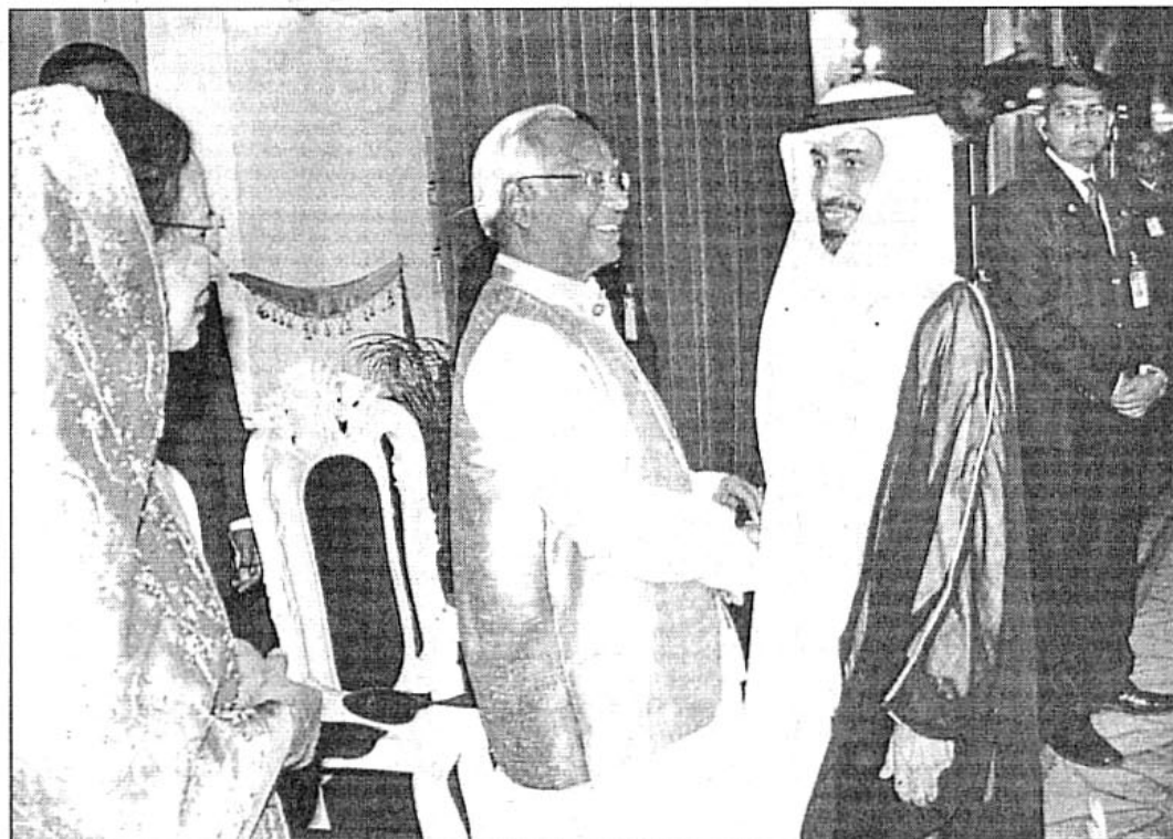
President Iajuddin Ahmed exchanges Eid greetings with foreign diplomats at Bangabhaban on Friday.

She plans to attend Harvard in the fall to prepare for a career in Business Management or Finance.