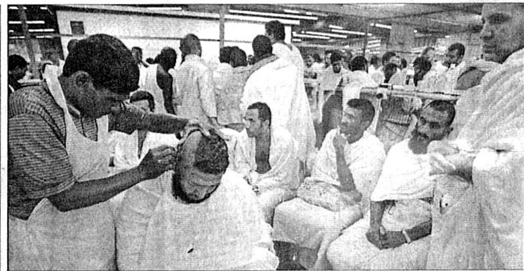
A Muslim pilgrim gets his head shaved while others wait for their turn after casting pebbles at the column symbolising the devil in Mina near the holy city of Makkah yesterday

Baluchistan has been in the grip of a three-year rebellion launched by ethnic Baluch rebels who want more political rights and a greater share of profits from the desert region's natural resources.