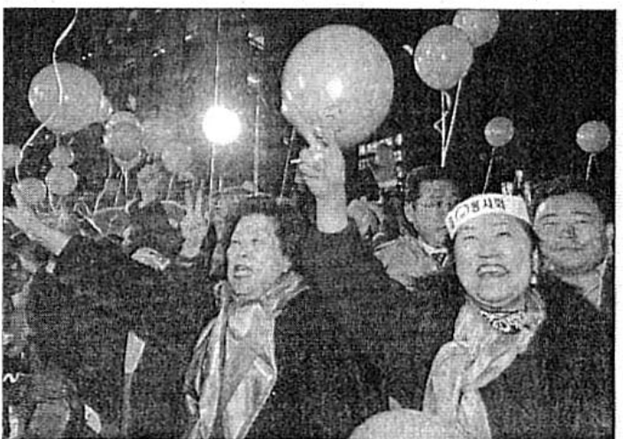
Supporters of Grand National Party (GNP) presidential candidate Lee Myung-Bak celebrate around outside the party's headquarters in Seoul yesterday. Former tycoon Lee Myung-Bak, who promises to reinvigorate South Korea's economy and take a tougher line with North Korea, won a landslide presidential election victory, according to exit polls and partial official results.

Koreans grappling with high youth unemployment, an ever-widening income gap and soaring property prices gave Lee an unprecedented mandate even though he faces a fraud investigation.