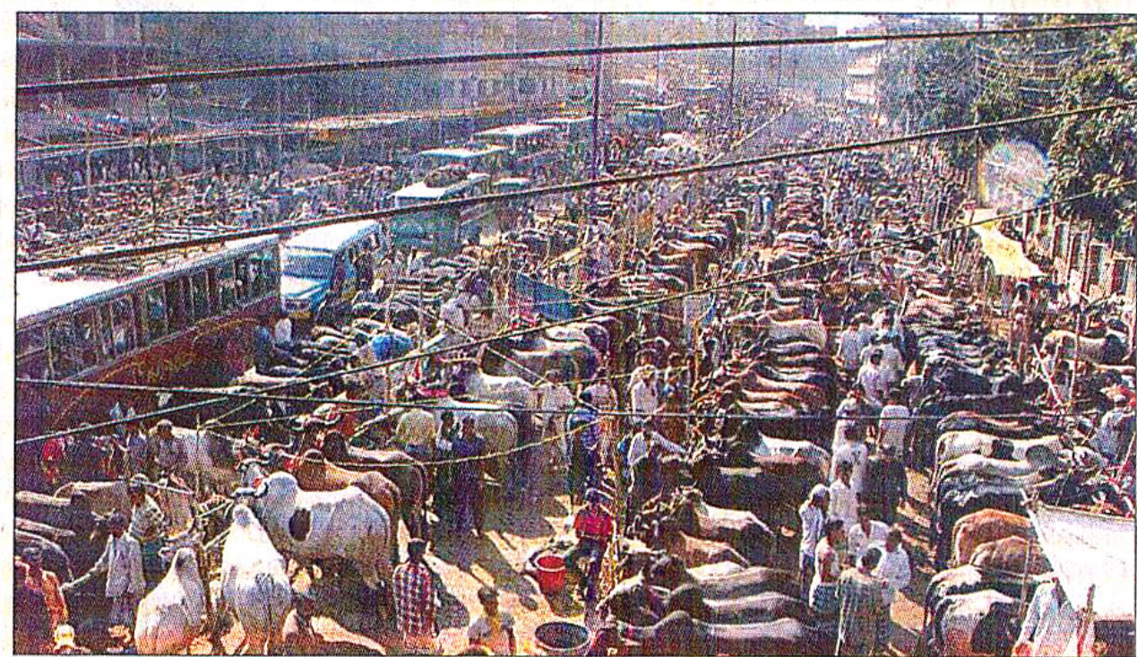
With Eid-ul-Azha only a day away, buyers through a cattle market at Naya Bazar near Buriganga bridge in the city yesterday to buy sacrificial animals.

The museum will open on December 25 after the Eid holidays.