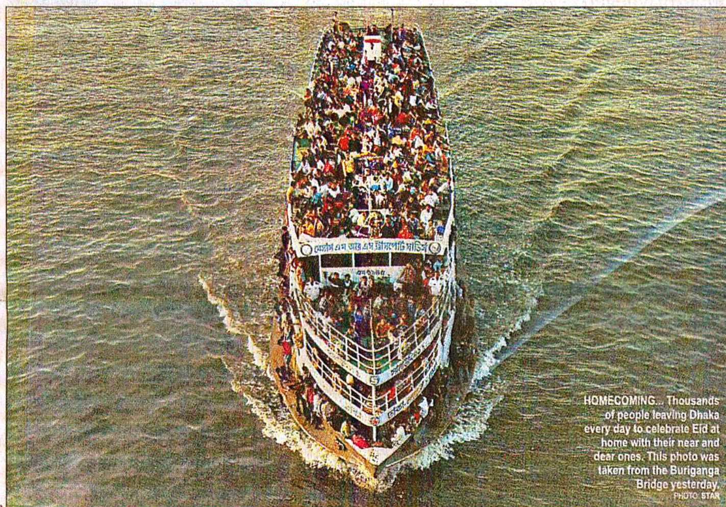
HOME COMING... Thousands of people leaving Dhaka every day to celebrate Eid at home with their near and dear ones. This photo was taken from the Buriganga Bridge yesterday.

Muslim pilgrims leave their tents to head toward the stoning of the column symbolising Satan at Al-Jamrat in Mina near the holy city of Makkah.