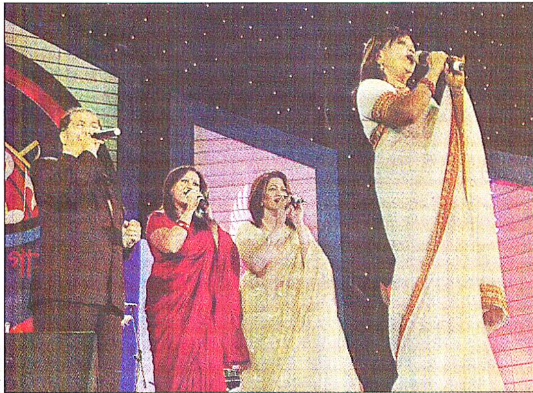
Sabina Yasmin (R) sings at the concert along with (from left) Subir Nandi, Fahmida Nabi and Shakila Zafar

Members of the band, Renaissance, started their performance with a song that inspired many