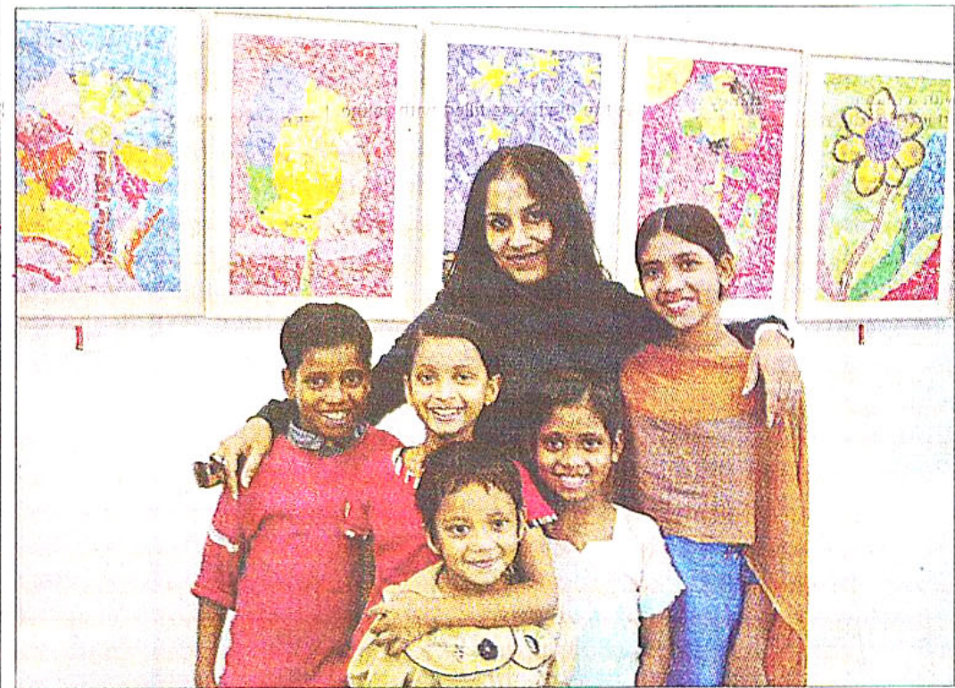
Students of 'Ashar Pothay' with one of the organisers (C)

Fifty percent of the revenue earned from the sales of these products goes to each child's savings account, while the rest goes back into the StreetWise project. It is StreetWise's dream that this ongoing effort will allow 'Ashar Pothay' to become self-sufficient and graduate to a boarding school in the near future.