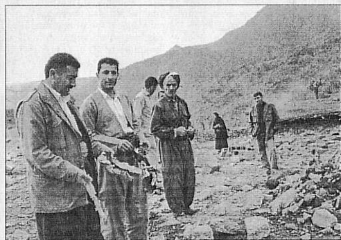
Iraqis inspect the damage following airstrikes by Turkish warplanes in Qandil Sunday. Turkey's bombardment of suspected PKK rebel rear-bases inside northern Iraq drew a furious response Monday from the Iraqi government and villagers hit by the airstrikes.

Tens of thousands of people have died on both sides in one of Asia's longest-running civil wars, which erupted in 1972 when the LTTE launched its campaign for a Tamil homeland in the majority Sinhalese nation.