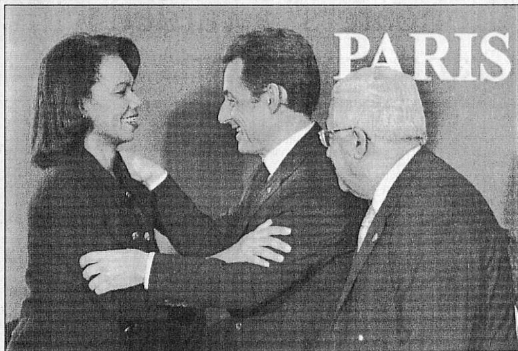
French President Nicolas Sarkozy (C) welcomes US Secretary of State Condoleezza Rice (L) as Palestinian President Mahmoud Abbas looks on yesterday in Paris at the start of the international donors conference to raise funds for the Western-backed Palestinian Authority at Kleber international centre.