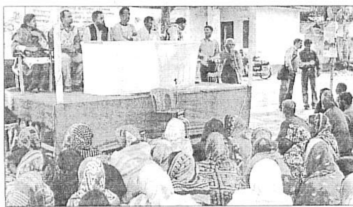
Government officials, representatives of local government institutions, ActionAid officials and villagers at the opening ceremony of a livestock service centre in Dharonibari union in Ulipur upazila, Kurigram.