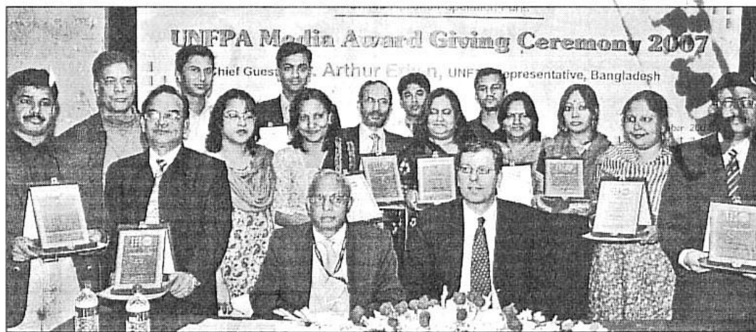
Recipients of the UNFPA Media Award 2007 pose for photograph with the guests at National Press Club in the city yesterday.

The programme also incorporates children's art exhibition, film projection and cultural function.