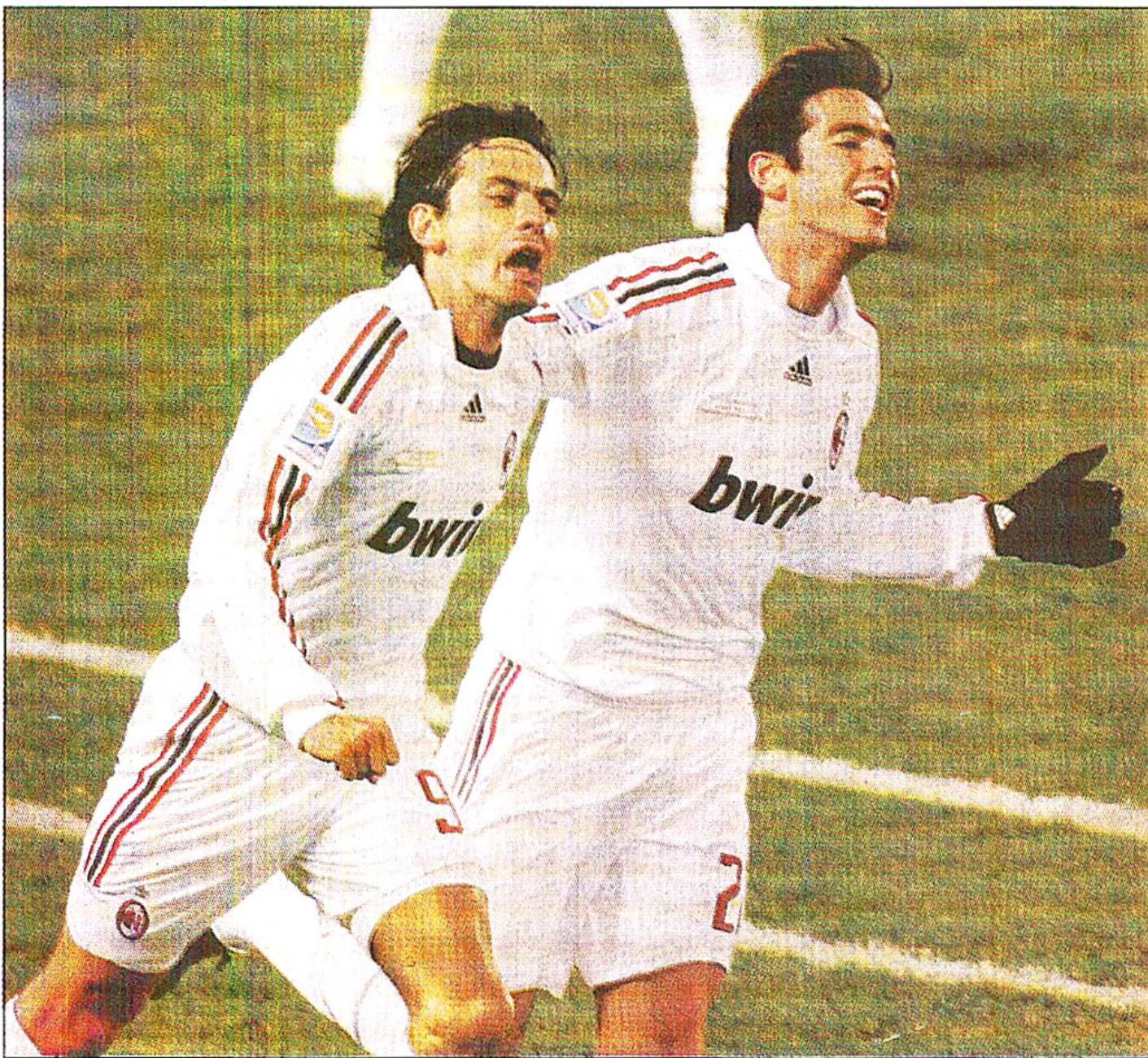
TURNING ON THE STYLE: Milan offensive players Kaka (R) and Filippo Inzaghi celebrate the latter's goal during their sparkling victory over Boca Juniors in the final of the World Club Cup in Yokohama on Sunday.

Argentine defender Gabriel Heinze returned to the squad after recovering from a knee complaint but German defender Christoph Metzelder was left out with a left foot injury.