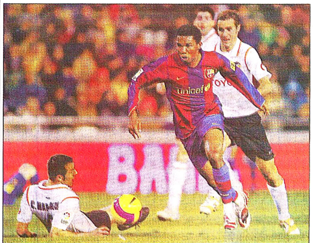
SUPER ETO'O: Barcelona striker Samuel Eto'o (C) leaves Valencia defenders Carlos Marchena (L) and Ivan Helguera in his wake during their Primera Liga encounter at the Mestalla on Saturday.