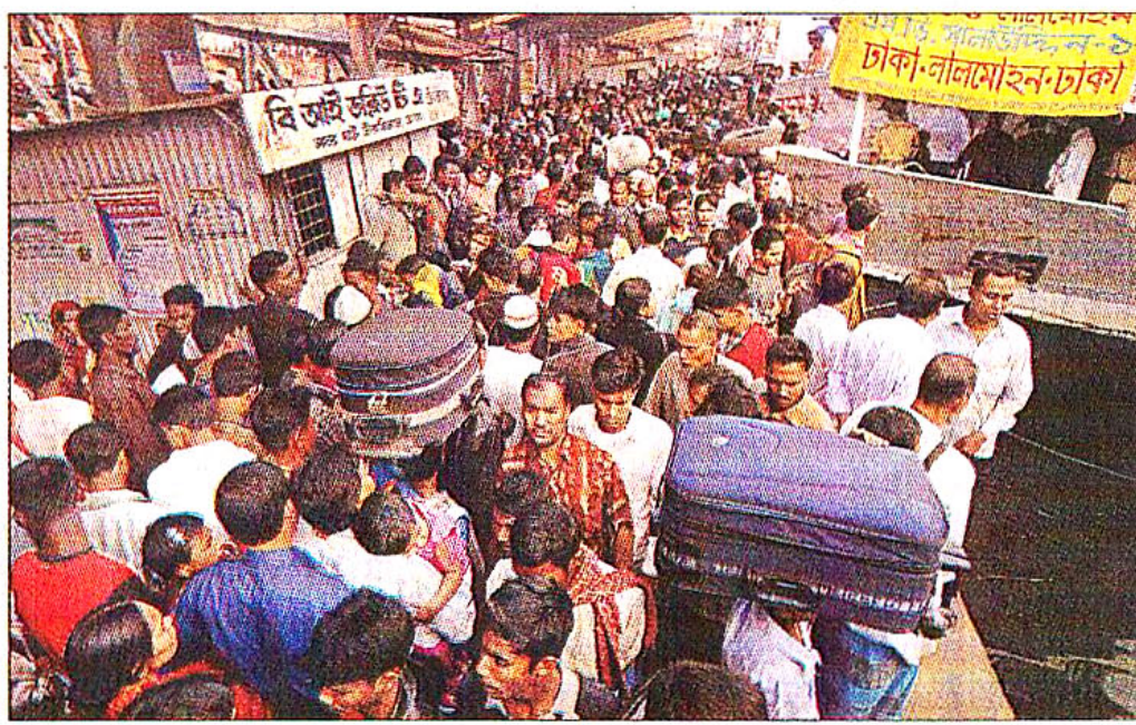
Passengers heading home to celebrate the Eid with their near and dear ones throng Sadarghat launch terminal in the capital yesterday.