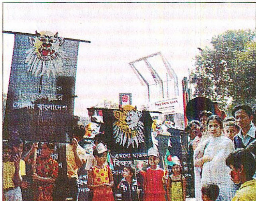
The symbolic procession by SSJ at the Central Shaheed Minar premises