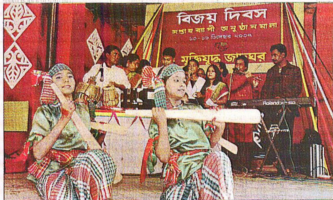
Students perform at the Victory Day celebration programme

Noted personalities including artistes and intellectuals demanded an immediate initiation of trials of the war criminals.