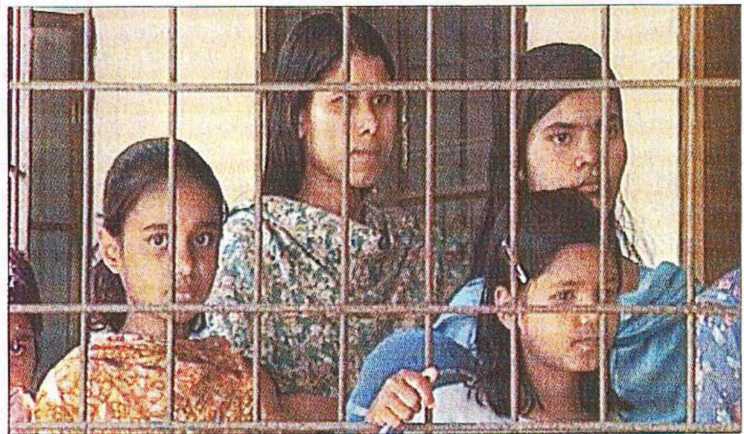
A scene from the documentary