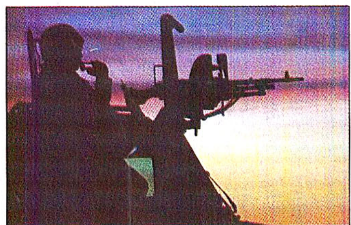
An African Union Mission in the Sudan (AMIS) peacekeeper from South Africa mans the gun on a Mamba fighting vehicle before sunrise Saturday at the Mission's base in the north Darfurian town of Kutum. The UN's Human Rights Council sought to pressure Sudan to prosecute those responsible for atrocities in Darfur and renewed the mandate for its special rapporteur in the African nation.