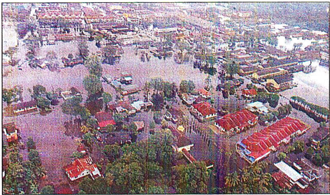
This aerial photograph taken on Saturday shows the town of Pekan, located in central Pahang state, submerged in floodwaters. Flooding in Malaysia have killed 21 people and left more than 29,000 people homeless as rising waters sealed off major roads in the country, reports said Sunday.

"Such operations will continue if need be," the Anadolu news agency quoted him as saying.