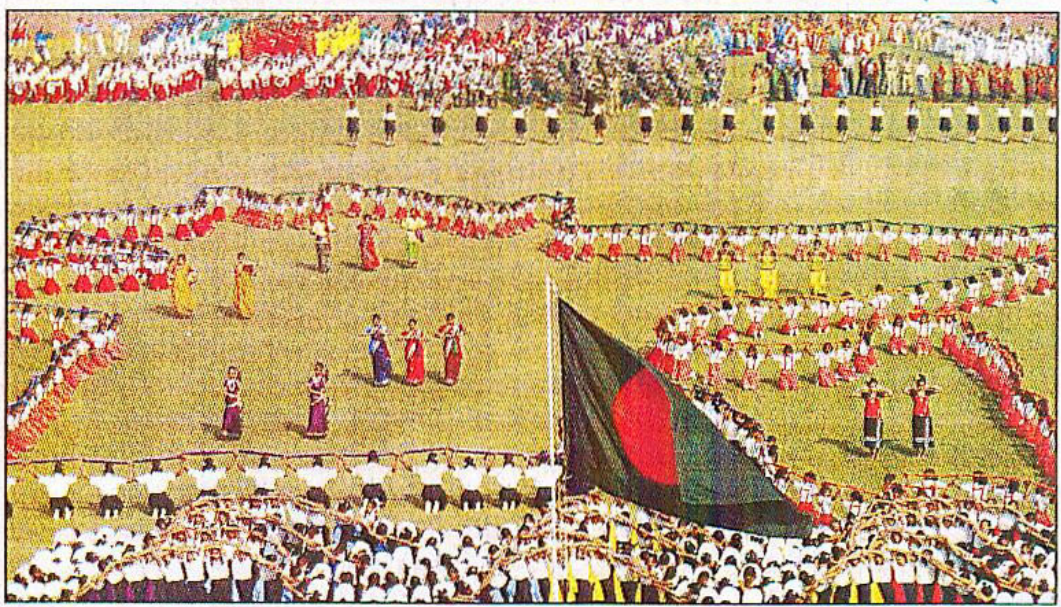
Students of Bharateshwari Homes present a colourful display at Bangabandhu Stadium in the city yesterday as part of the programmes to mark the Victory Day.