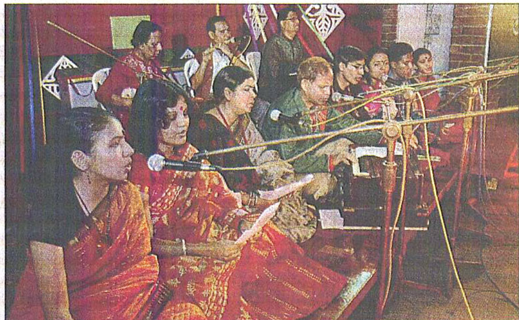
Artists of Nibedan perform folk songs at the Liberation War Museum