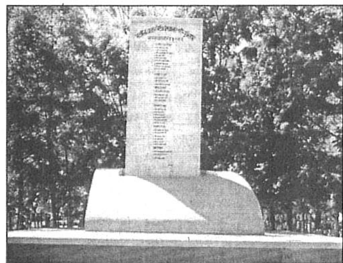
The victory memorial in Satkhira town that contains names of some fake freedom fighters and a razakar along with those of martyred freedom fighters.