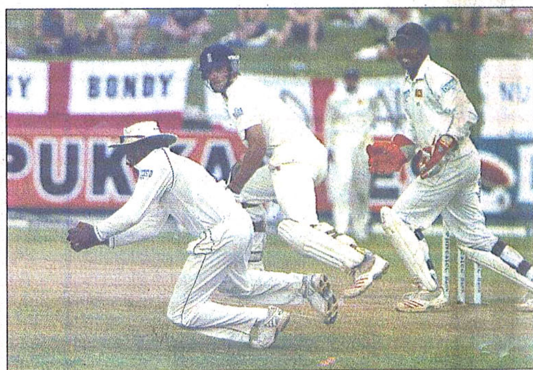
Sri Lanka captain Mahela Jayawardene (L) takes a sharp catch at slip to remove England opener Alastair Cook (C) on the fifth and final day of the drawn second Test at the Sinhalese Sports Club ground in Colombo yesterday.