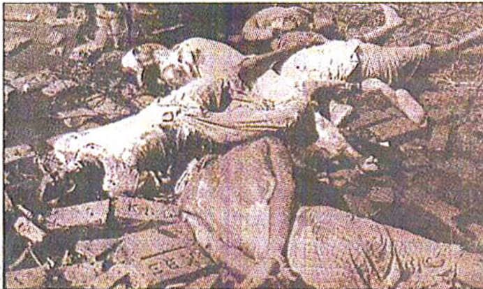
Bodies of unknown intellectuals dumped at Rayer Bazar mass killing field by local collaborators of Pakistan army days before Bangladesh won the Liberation War.