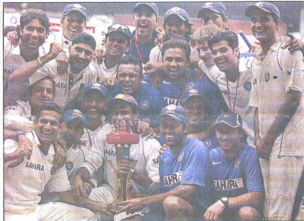
END OF A LONG WAIT: Members of the Indian cricket team celebrate with the winners' trophy after their 1-0 triumph in the three-match Test series against Pakistan, their first at home after 27 years, at the Chinnaswamy Stadium in Bangalore on Wednesday.

verge of defeat with his 34th haul of five or more wickets in a Test innings. Ganguly's march towards a rare feat and Pakistani fast bowler Shoaib Akhtar's duel with the batsmen were the only talking points in the first two sessions. Former captain Ganguly fell nine runs short of becoming the seventh batsman to score a double-century and a hundred in a Test. The left-hander, who cracked a maiden double-ton in the first innings, was dismissed for 91 after an impressive exhibition of strokeplay. Ganguly looked set to join the elite club in his 99th Test before uphilly driving fast bowler Mohammad Sami to Iqbal, who took a smart catch at gully. But he had completed 1,000 runs in a calendar year at that stage. Australians Doug Walters and Greg Chappell, West Indies' Lawrence Rowe and Brian Lara, Gavaskar and England's Graham Gooch are other batsmen to have scored a double-century and a hundred in the same Test. Ganguly and later Venkatesh Laxman were involved in a fascinating duel with Akhtar, who was at his best in his final innings of the SEE PAGE 18 COL 2