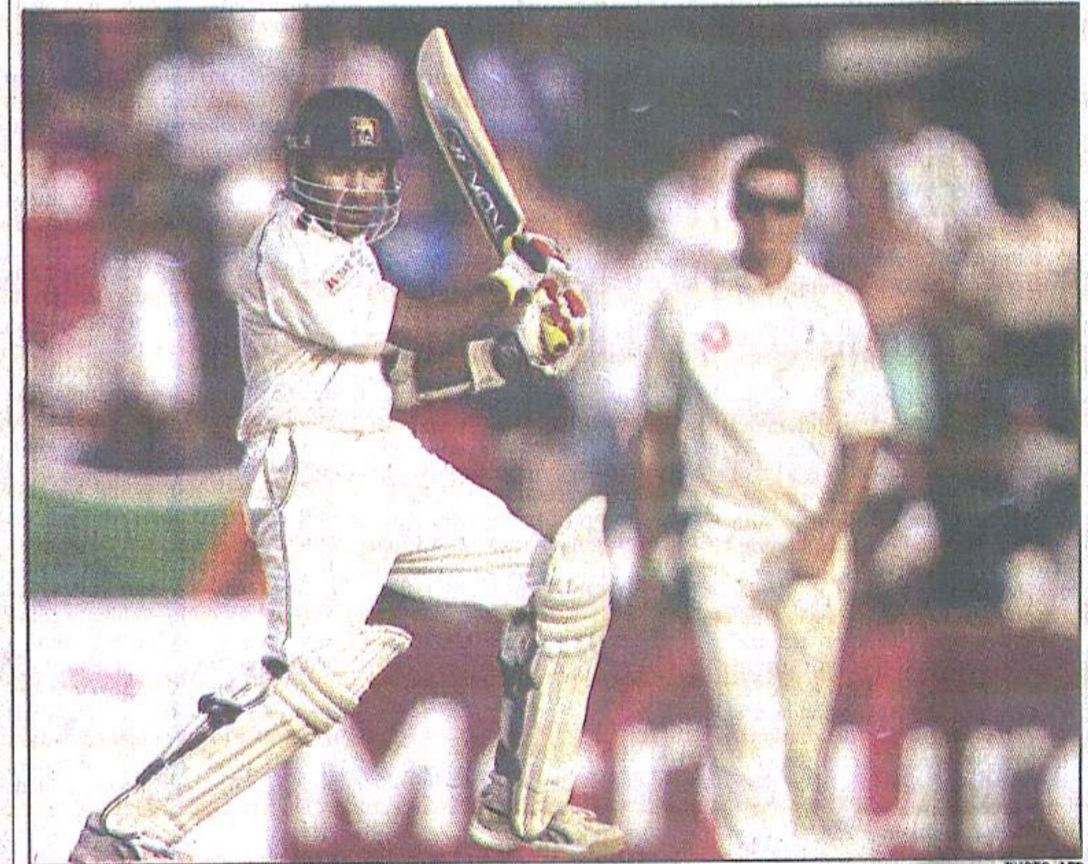
SUBLIME SKIPPER: Sri Lanka captain Mahela Jayawardene plays his trademark square-cut during his unbeaten 167 against England on the third day of the second Test at the SSC ground in Colombo on Tuesday.