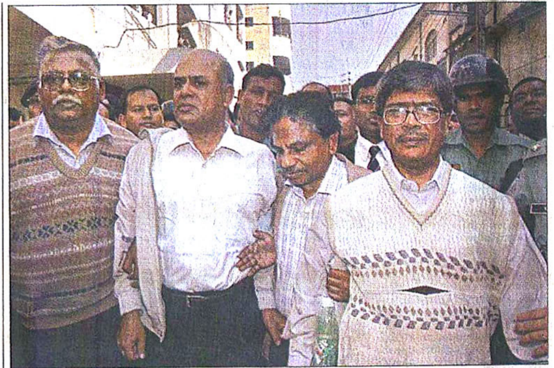
The four Dhaka University teachers detained in connection with violating Emergency Power Rules in August being produced before a Dhaka court yesterday for hearing on charge framing.