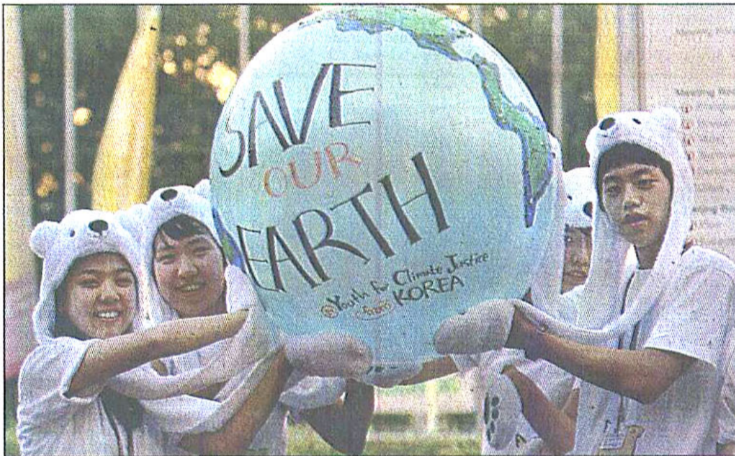
South Korean demonstrators hold a plastic globe at the venue of the UN Climate Change Conference 2007 in Nusa Dua, Bali, yesterday. The worldwide forum on climate change marked the 10th anniversary of the Kyoto Protocol but the celebrations were shadowed by doubts on a new pact to tackle global warming.

Advani, 80, is at present the leader of the Opposition in Parliament and was deputy prime minister during the prime ministership of Vajpayee from 1999 to 2004 when the BJP-led alliance was voted out of power in parliamentary elections that brought Sonia Gandhi-led Congress party back to power at the head of a coalition.