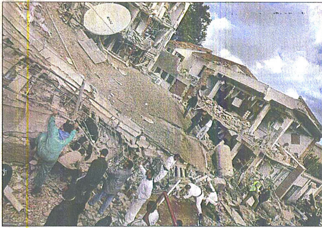
Algerian rescue workers and bomb experts search for survivors under the rubble of a destroyed building near the United Nations refugee agency (UNHCR) offices yesterday in the Hydra district of Algiers. Hospital sources said at least 52 people were killed, and a number of foreigners injured, in two blasts that rocked the Algerian capital on Tuesday.