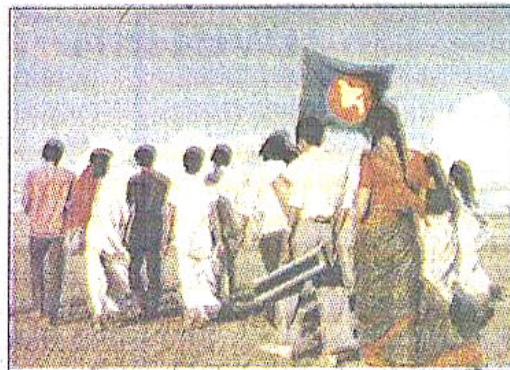
A scene from Mukti Kaan

On the occasion of Victory Day, a four-day session of films on Liberation War by Tareque Masud and Catherine Masud will be screened at the Shawkat Osman Auditorium, Central Public Library from