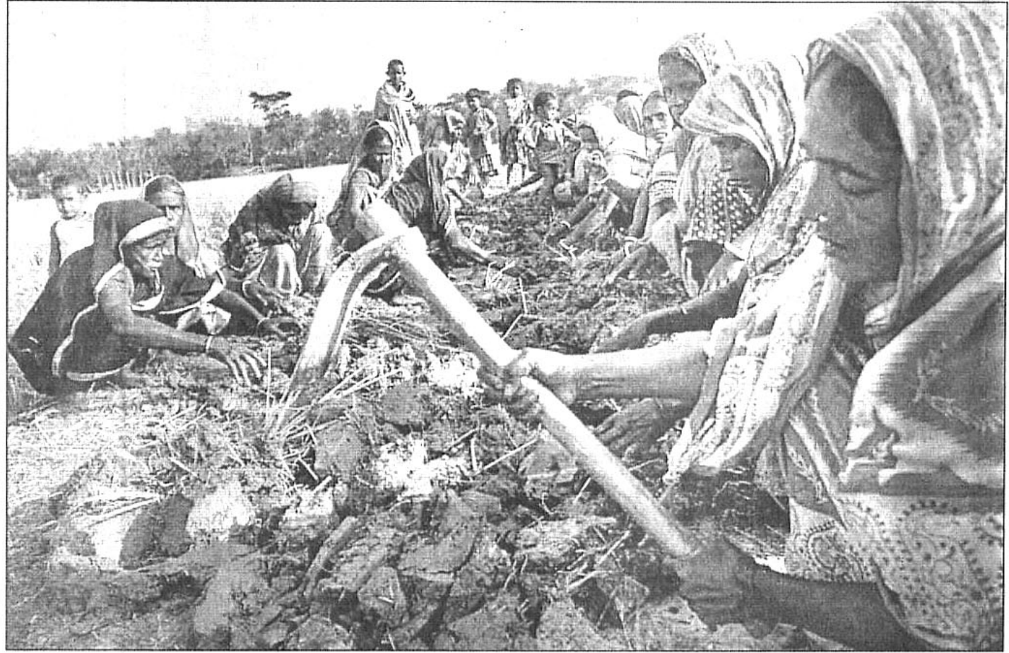
Left helpless by the recent Sidr, women doing the arduous task of road repair for living at Pakhimara village in Kalapara upazila in Patuakhali. The photo was taken yesterday.