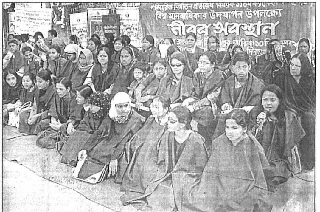
Marking International Human Rights Day, employees of Pallishree, a local NGO, in black skirts stage a silent sit-in on the premises of Dinajpur Press Club yesterday as part of campaign to prevent domestic violence against women.