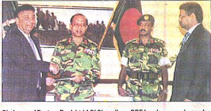
Chairman of Eastern Bank Ltd AQI Chowdhury OBE hands over a cheque for Tk 50 lakh to Chief of Army Staff General Moeen U Ahmed at Dhaka Cantonment recently for the cyclone-affected people.