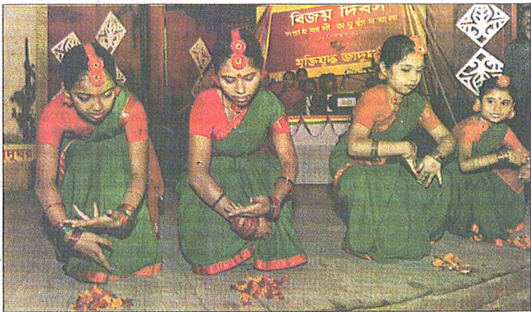
Children of Oroni School yesterday perform at the inaugural function of a week-long programme of Liberation War Museum on its premises in the city, marking the Victory Day.