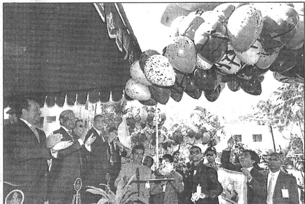
Chief Adviser Fakhruddin Ahmed inaugurates the 'First Saarc Youth Camp 2007' by releasing balloons at National Youth Centre in Savar yesterday.

Later, the chief adviser visited the display centre of the self-employed youth of Bangladesh at the National Youth Centre.