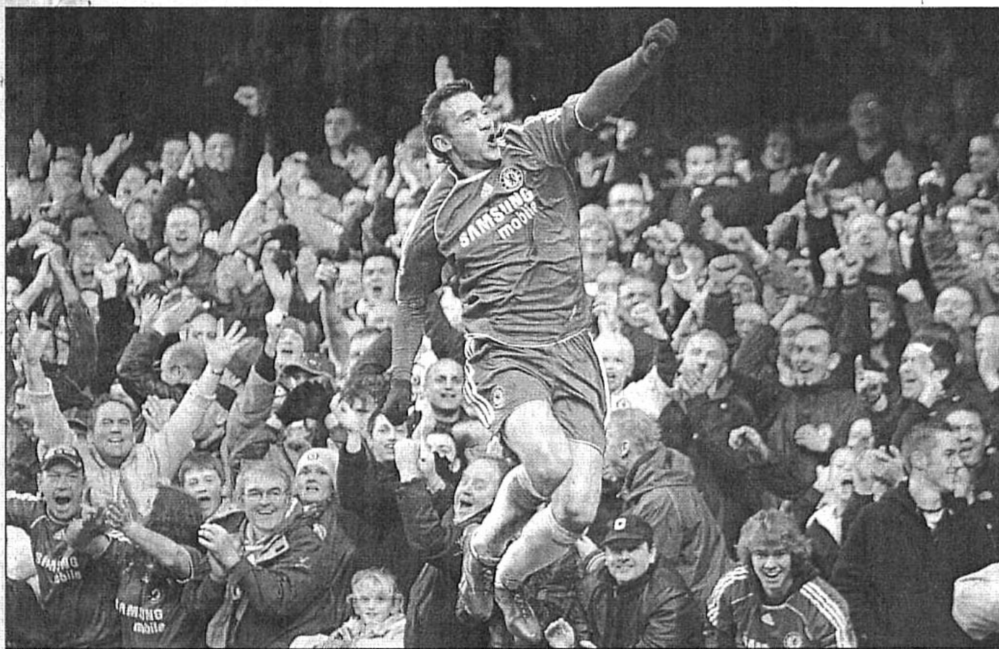
Chelsea striker Andriy Shevchenko goes airborne after scoring the first goal against Sunderland during their Premiership match at Stamford Bridge on Saturday.