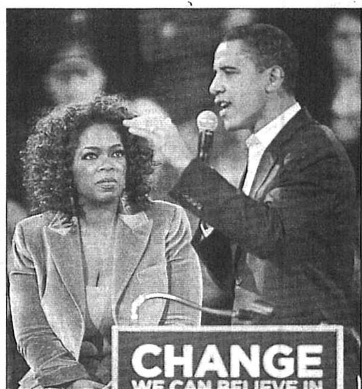
Talk show host Oprah Winfrey (L) listens as Democratic presidential hopeful Sen Barack Obama (D-IL) addresses a crowd gathered for a campaign rally Saturday in Des Moines, Iowa.

"We have established stable communications with the satellite. The Kosmos 2434 satellite is functioning normally," he said.