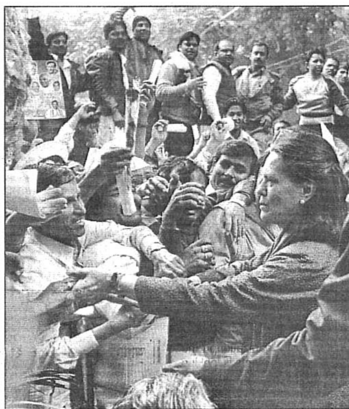
Congress Party President and Chairperson of India's Congress-led United Progressive Alliance (UPA) Government Sonia Gandhi (R) meets with supporters during her 61st birthday celebration at her residence in New Delhi yesterday. Thousands of party supporters offered their greetings to Sonia.

The move has been met with international criticism, including the suspension of the country's Commonwealth membership. It has also raised concerns that the upcoming general elections would not be held in a free, fair and transparent atmosphere.