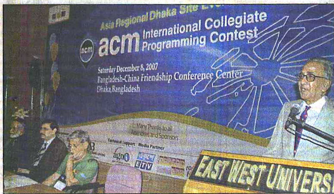
Former chief adviser to a caretaker government Justice Muhammad Habibur Rahman speaks at the Asia Regional Dhaka Site Event 2007 on 'ACM International Collegiate Programming Contest' at Bangladesh-China Friendship Conference Centre in the city yesterday.