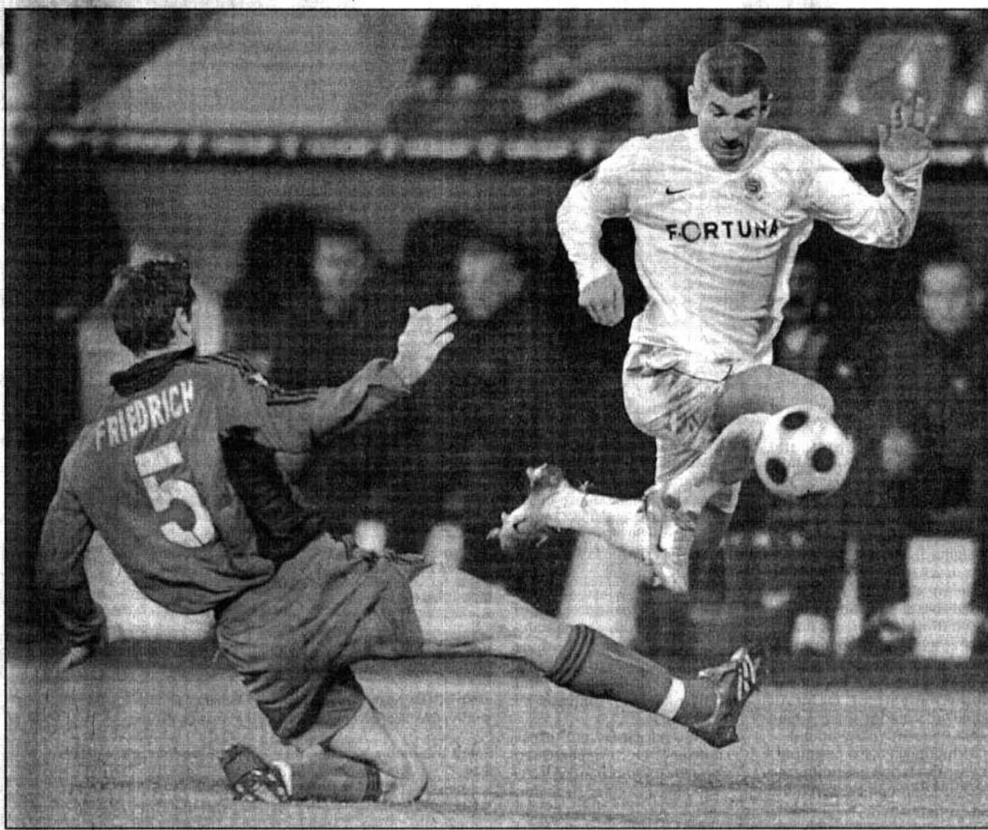
Sparta Prague winger Jan Rezek (R) skips the challenge of Bayer Leverkusen defender Manuel Friedrich during their UEFA Cup match at the BayArena on Thursday.