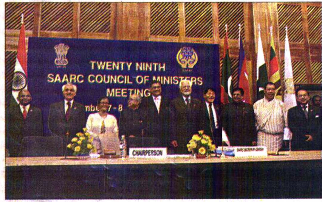
Dignitaries of South Asian nations pose for a group photo before the meeting of Saarc Council of Ministers in New Delhi yesterday.