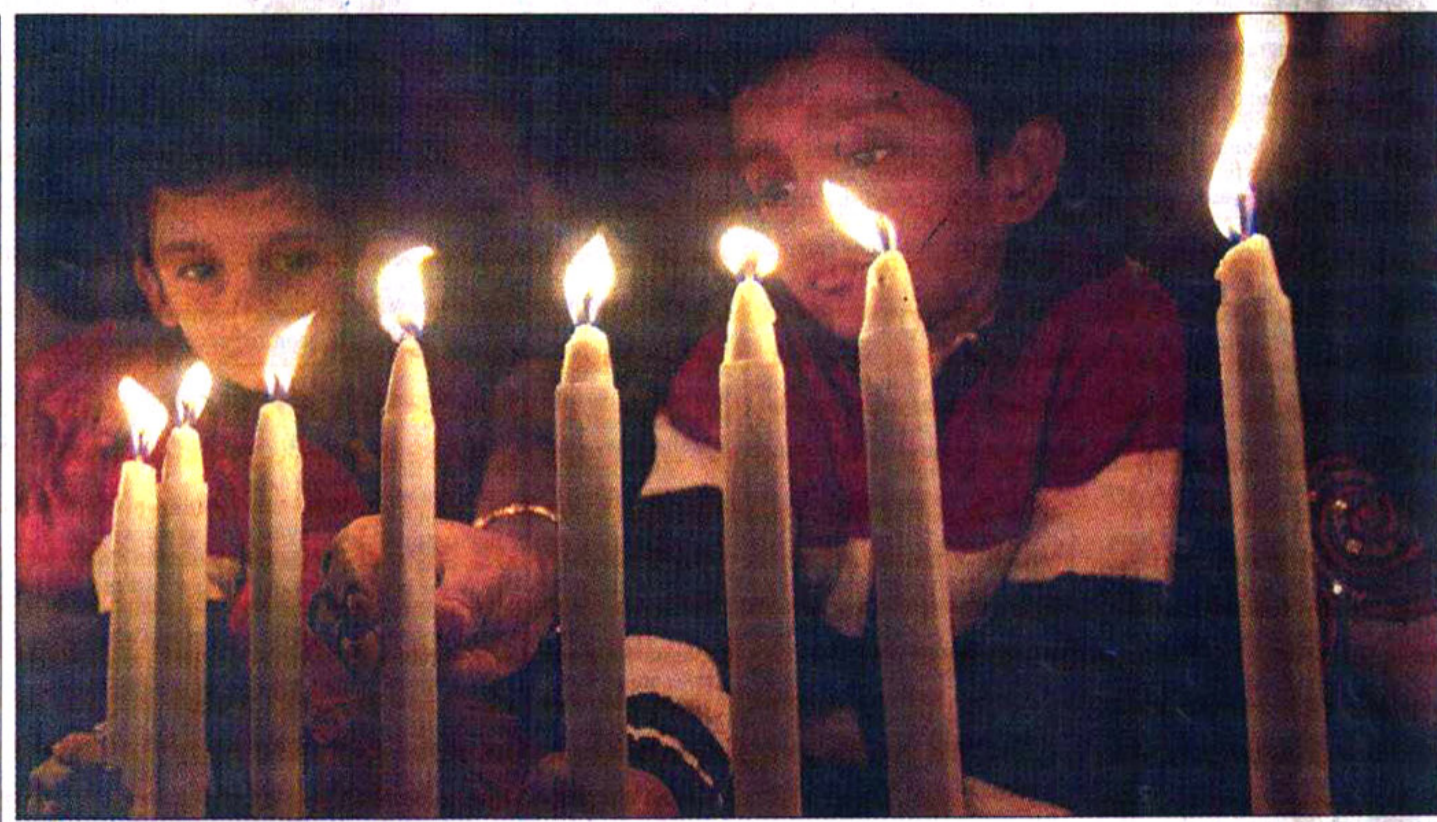
Children light candles at the Central Shaheed Minar in the capital yesterday evening in commemoration of the loved ones lost in the Liberation War. Naripakkha, a women's rights organisation, arranged the event.

STAFF CORRESPONDENT Chief Justice Md Ruhul Amin yesterday called upon the international community to restructure the management of international institutions in order to ensure equality, fairness, and democratic practices. "Further negotiation under the WTO should focus on expansion of fair trade and not just free trade," the chief justice said as the chief guest at a book publication ceremony in Brac Centre Inn of the capital. He hoped for global justice in an inclusive and fair global economic order that might put an end to poverty. He underscored the needs for more access to the markets of developed countries for exports from the developing countries, and for extending the principle of free movement of workers as well. The book titled 'National Law in